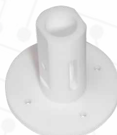
GMTRB-FX2-IS STYLUS SUPPORT MADE IN "POM-C"

Recommended use is when stylus is longer than 850mm.