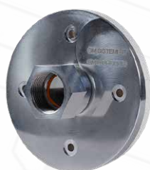
GMTRB-FX1-34 MOUNTING KIT for all versions of triboelectric probes. Suitable for installation in zones classified ATEX: Category 2D/2G