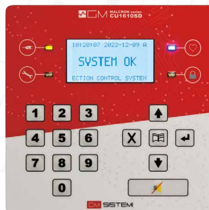
Control unit panel