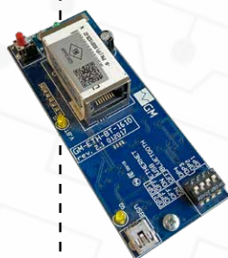
ETHERNET CARD USB (optional) GM-ETH-BT-1610-FM