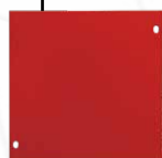
STEEL CAP (included) GMTC4